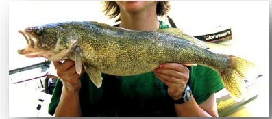
This Saugeye was captured and released the last time the EPA assessed this site.

This volunteer training will take place Wednesday, May 28, at 11 a.m. at River Run Preserve located at: 158 Main Road, Delaware.