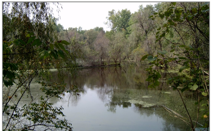
Pond at Deer Haven Preserve