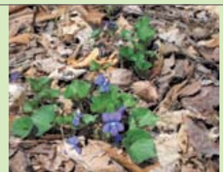
Common Blue Violets