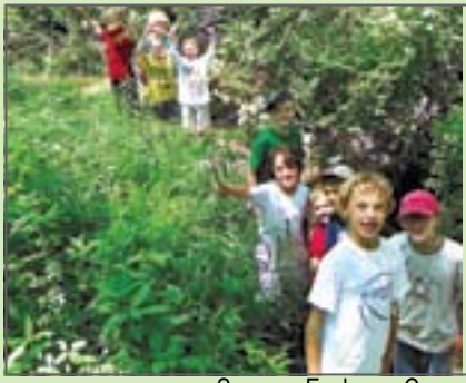
Summer Explorers Camp