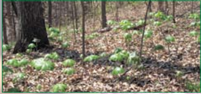
Mayapples at Hogback Ridge Preserve