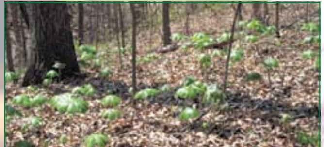
Mayapples at Hogback Ridge Preserve