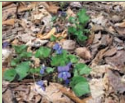
Common Blue Violets