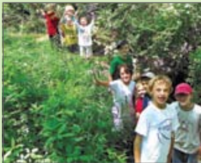
Summer Explorers Camp

Registration: 740-524-8600, ext. 6, or e-mail: saundras@preservationparks.com